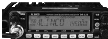
DR-638HE European amateur radio version

※ Peripherals like an antenna, mounting hardware, coax cable etc are required for proper operation.